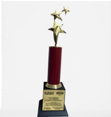
CONSTRUCTION INDUSTRY AWARD 2015