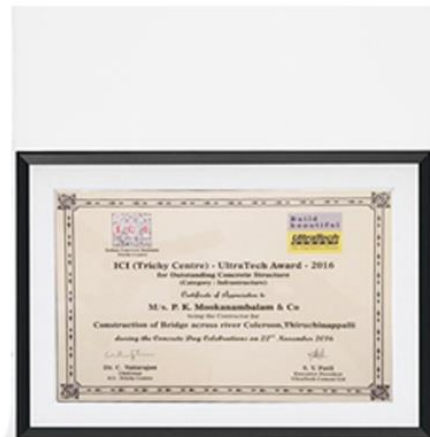
ULTRATECH AWARD FOR THE BEST OUTSTANDING STRUCTURE